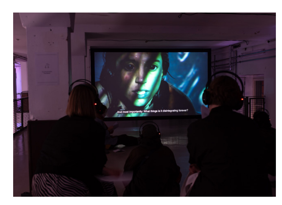
Cru Encarnação: The Ballad

In her work, Fette Sans asks: "Does it sometimes feel like a betrayal to go away from the screen for touch?" Mushtrieva's performance replies: we are one with the screen. Ambient noises reach us through our individual headphones, as we stand around the room, disconnected from the acknowledgement of a shared experience. Whispering, scratching, snapping and tapping, all become the background sounds of a meditation on rituals, wherein the fingers are the main protagonists. As I listen, I type out notes on my phone, I take a photo. It's a force of habit, this virtual extension, this cataloguing of experience. Mushtrieva loosely takes us through (this is the "guided tour") a series of socially embedded rituals, like household chores and folk dances, landing us in a numerological study of Google Map addresses. We are led to observe the mystical dimensions of our own unquestioned daily routines, with the phone as the totemic figure. How will these ritualized practices be understood in the distant future?